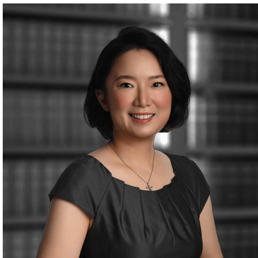
Keynote Speaker: Queenie Lau SC

Date: 12 September 2025 (Friday) Venue: Hong Kong International Arbitration Centre 38/F, Two Exchange Square, 8 Connaught Place, Central, Hong Kong Time: 08:30 – 17:30 (Lunch provided) Drinks Reception: China Club 13-14/F, Old Bank Of China Building Bank St, Central Time: 18:00 – 20:00 Price: HKD 750 (Members) HKD 1,000 (Non-Members)