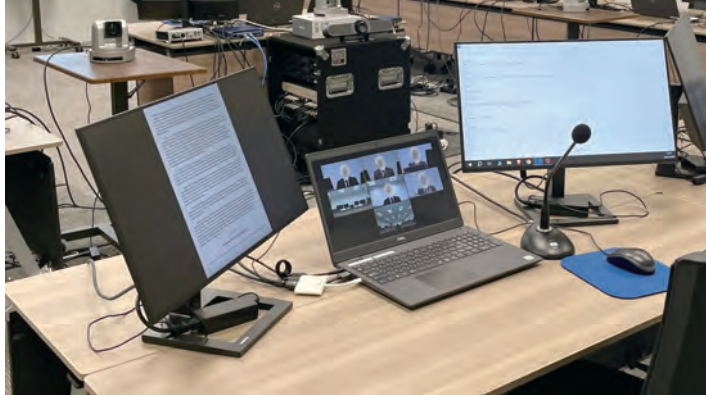
-Three monitors prepared for each participant: one for the evidentiary documents (left), one for the camera views (center) and one for the live transcription (right)-

vendor according to the request of such counsel team. It was useful for the smooth operation of the process of cross examination, especially when the evidentiary documents codified in a hearing bundle were of a large amount.