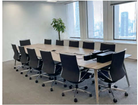
-A Breakout Room in TFAH-

service based on the advanced technologies with its professional engineers to other facilities where much larger-scale hearings or events are organized. Even after the closure of the government-related hearing facilities, arbitration hearings with advanced technologies in Japan can be smoothly operated at the facilities of TFAH or at other facilities with the assistance of TFAH.