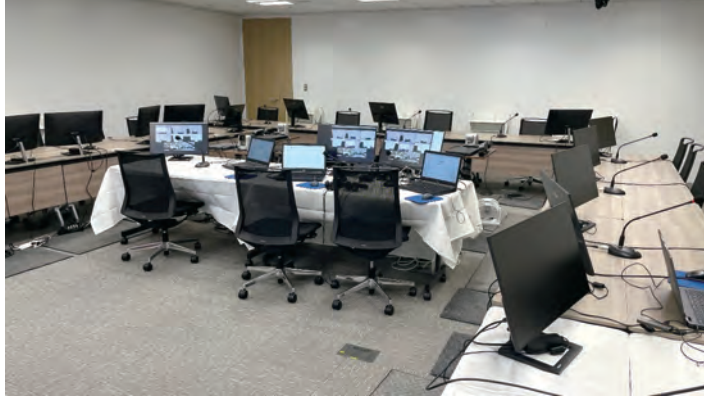
-The seats for the interpreters next to the witness(es)-