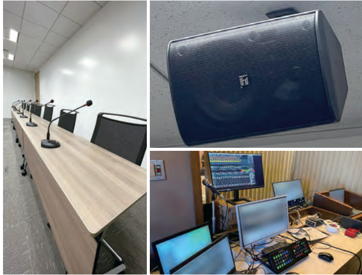
-Microphones, Speakers and the Backstage for the Engineers-