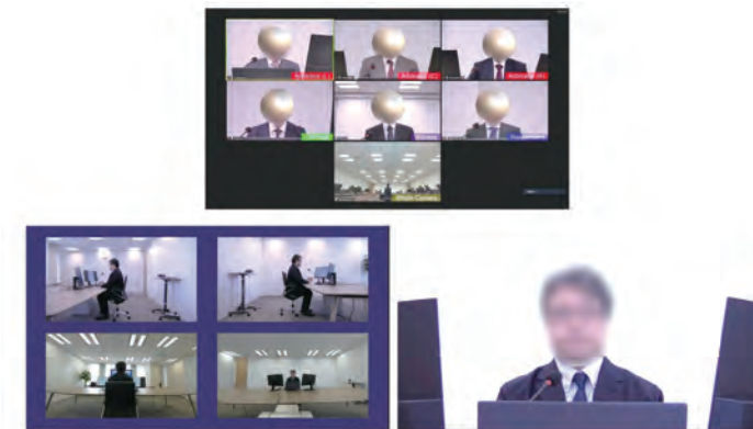
-A View with the Four Cameras surrounding a Witness in TFAH-

Games 2020. Similarly, many hybrid-style hearings were and are organized in TFAH with the following advanced cameras and sound systems.