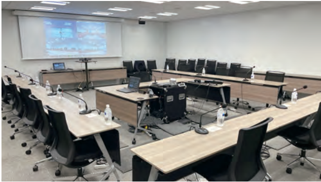
-Hearing Room in TFAH-