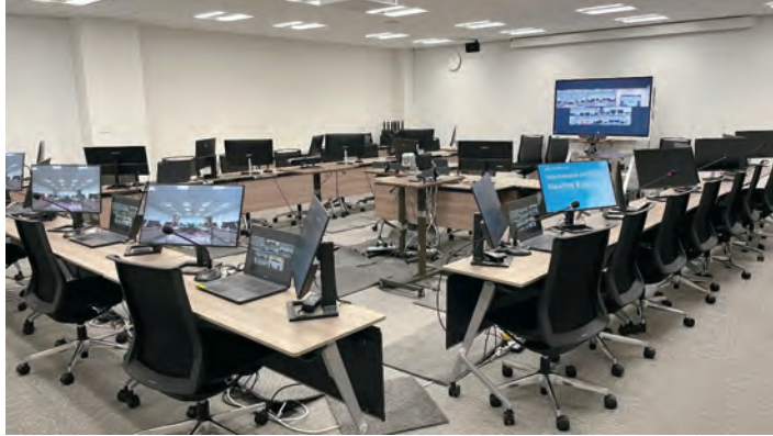
-A Hybrid-Style Setting in Hearing Room of TFAH-

Another serious risk of the simple use of online meeting systems is the stability of the Internet connection. An Internet connection from home is sometimes weak and unstable. Normally, there is no professional engineer for a potential trouble of the Internet connection. If sounds and/or pictures are not seamlessly provided due to a problem of the Internet connection, the arbitration hearings cannot be organized as scheduled.